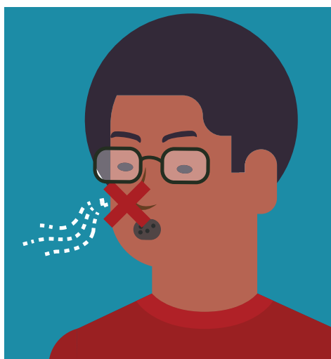
New loss of taste or smell