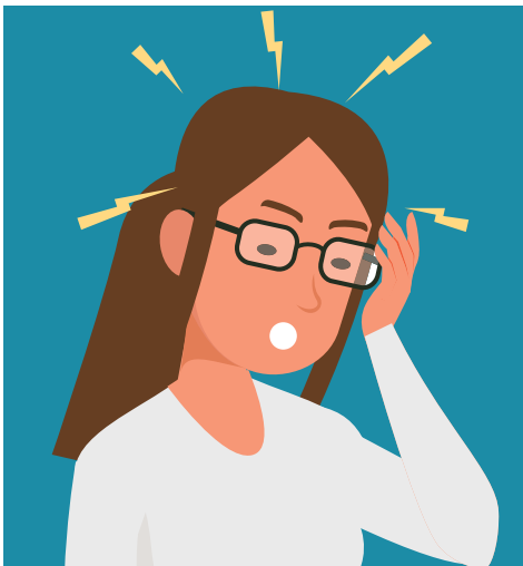
Fatigue, headache or body aches