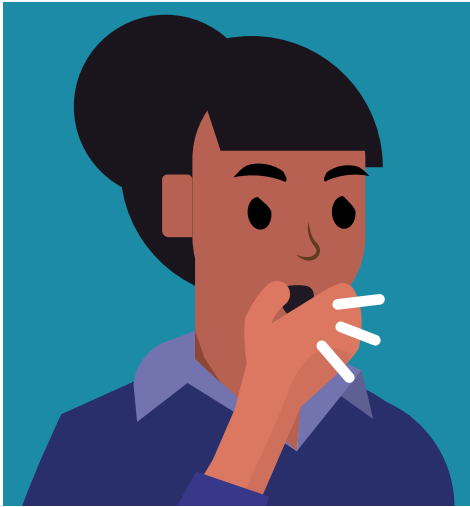
Cough, shortness of breath or difficulty breathing