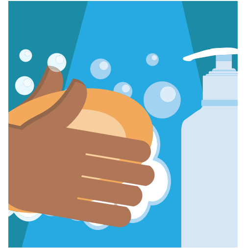
Wash your hands with soap and water for at least 20 seconds or use alcohol base cleanser