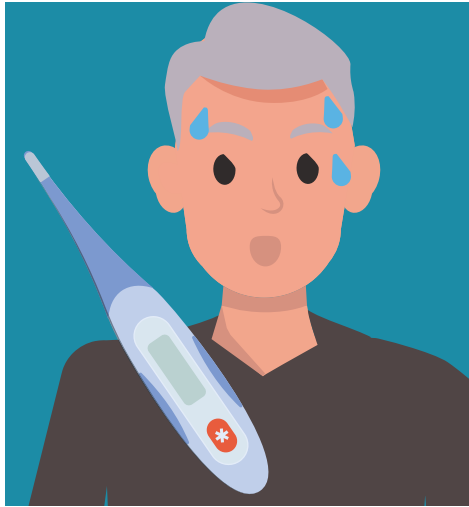
Sore throat, fever or chills