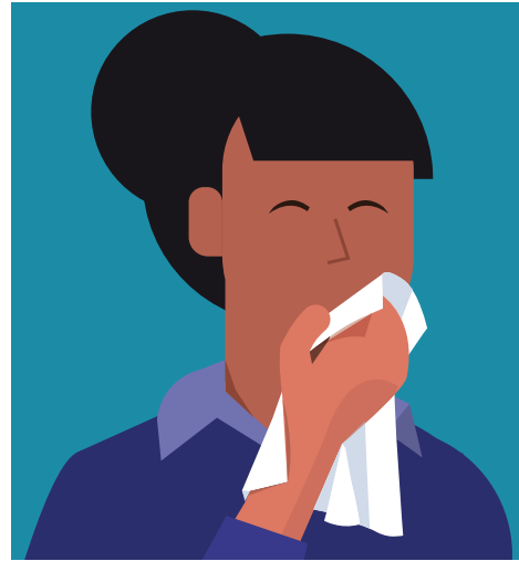
Cover your nose and mouth when you cough or sneeze and discard tissue