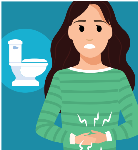
Nausea, vomiting or diarrhea