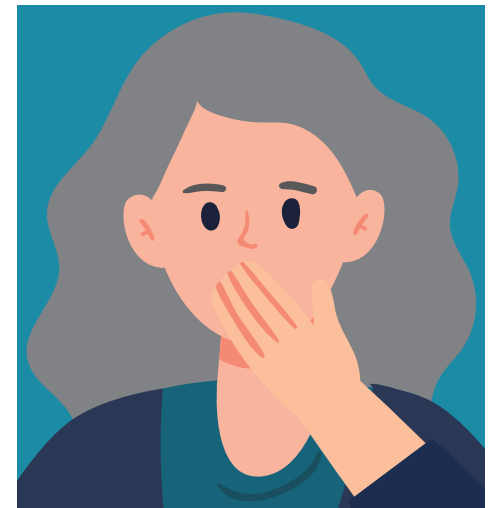
To reduce spread of germs, avoid touching your eyes, nose, or mouth