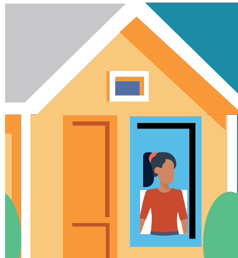
Stay at home and limit contact with others if you are sick and avoid contact with sick people